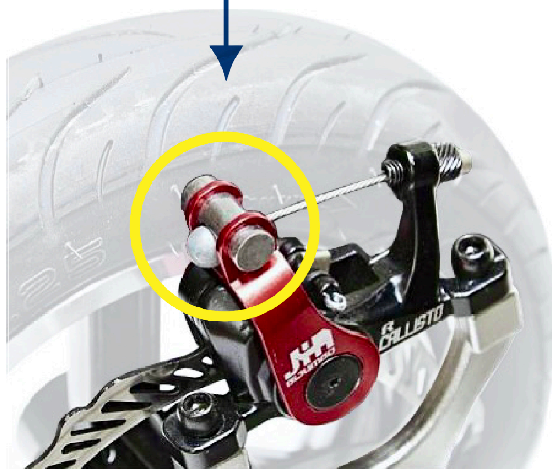
左後輪卡鉗 Left rear wheel calliper